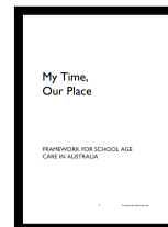
My Time, Our Place; Framework for School Age Care in Australia

Critical reflection: Reflective practices that focus on implications for equity and social justice ( Early Years Learning Framework – refer to Sources ).